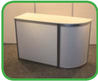
(Ex 101-104 + 103)