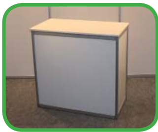
101, 102, 104 (front)