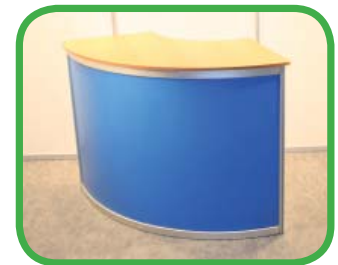
Extras, all desk whit wood & color